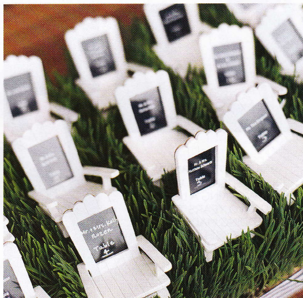
Mini Adirondack-chair escort cards referenced the full-size ones that dot Castle Hill's lawn.