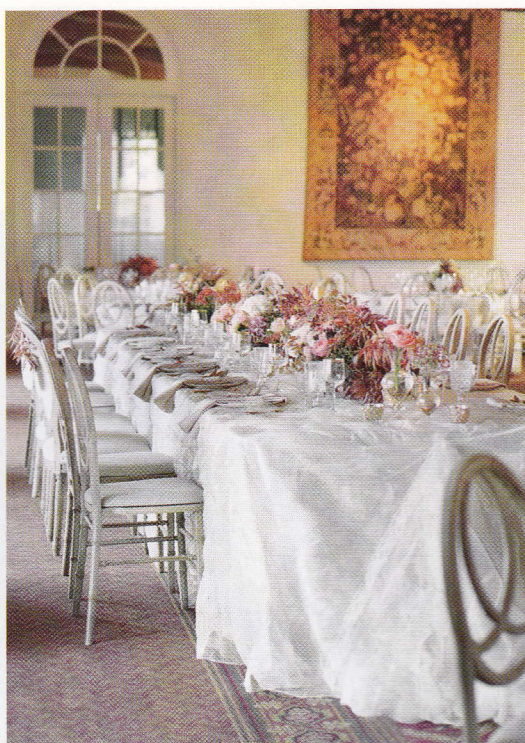
A long, rectangular king's table, set for the wedding party, was topped with roses, pistachio berries, spider orchids, and hydrangeas.