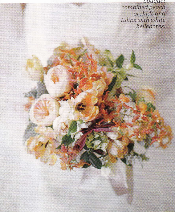
The bride's bouquet combined peach orchids and tulips with white hellebores.