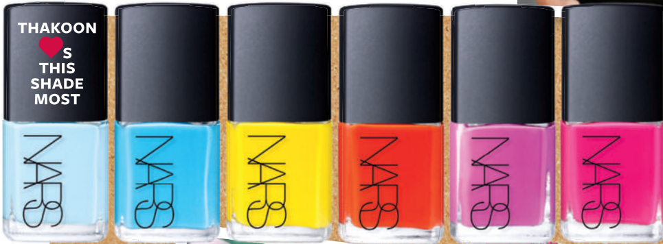
Nars nail polish in (from left) Kutki, Koliary, Amchoor, Lal Mirchi (646-459-2323), Ratin Jot, and Anardana, $18 each; nars cosmetics.com.