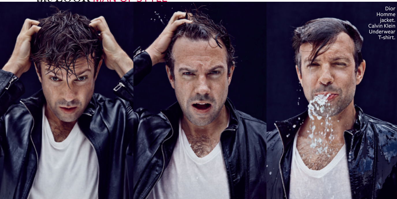
Dior Homme jacket. Calvin Klein Underwear T-shirt.

You were into hats? I actually wore a fedora to my senior prom. I had discovered Frank Sinatra and the Rat Pack—it was an homage to that. Back then no one sold fedoras, so I had to rent it at a costume shop. It was part of a gangster costume. Now you can find them all over the place thanks to Justin Timberlake and Bruno Mars. I never returned it, by the way. It's back home, in my parents' closet.