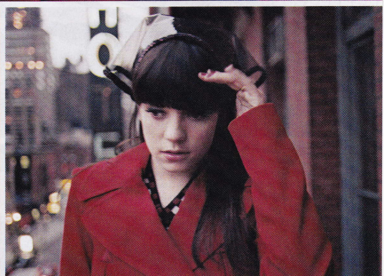
Left: Yellow plaid wool trench coat, Jean Paul Gaultier, $4,135, at Select Saks Fifth Avenue. Belt, Chanel. Above: Red fitted wool trench coat, $1,900, velvet dress, $1,560, both, Jean Paul Gaultier, at Jean Paul Gaultier Boutique, Las Vegas. For details, see Shopping Guide.