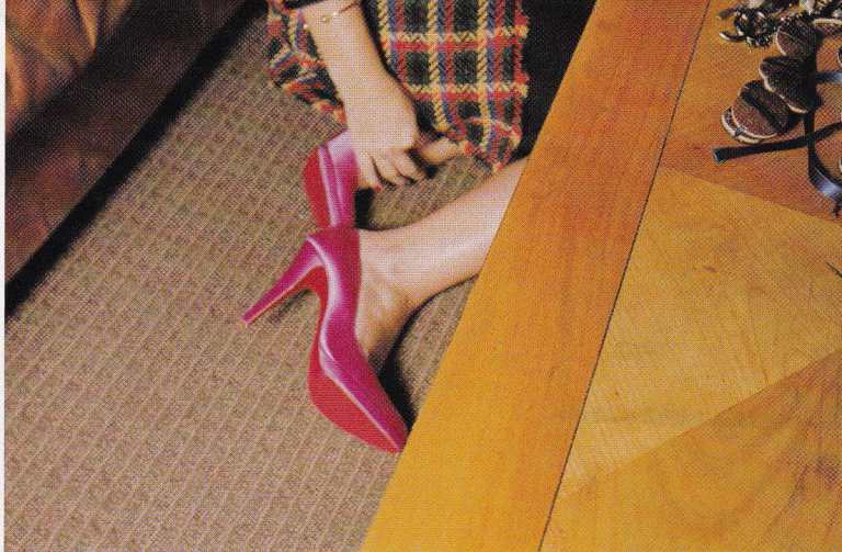
Plaid tweed coat, $3,700, strand necklace, both, Chanel, price upon request, at select Chanel Boutique nationwide. Wool dress, Sonia Rykiel, $1,165. Gold bangle, David Yurman. Sunglasses, Ksubi Eye. Satin pumps, Christian Louboutin. For details, see Shopping Guide.