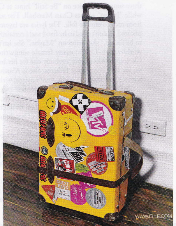
Allen's own suitcase, plastered with tour stickers