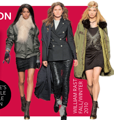
WILLIAM RAST FALL/WINTER 2010