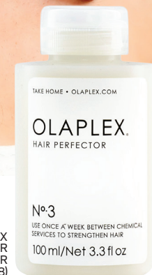
OLAPLEX HAIR PERFECTOR NO. 3 ($28)