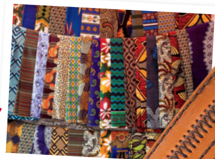
A display of silks in Tanzania

“Growing up in the U.K., The Dukes of Hazzard was almost alien. Daisy? No one in England looked like that. But we thought everyone in America did. This is my homage.” Denim and leather, $835.