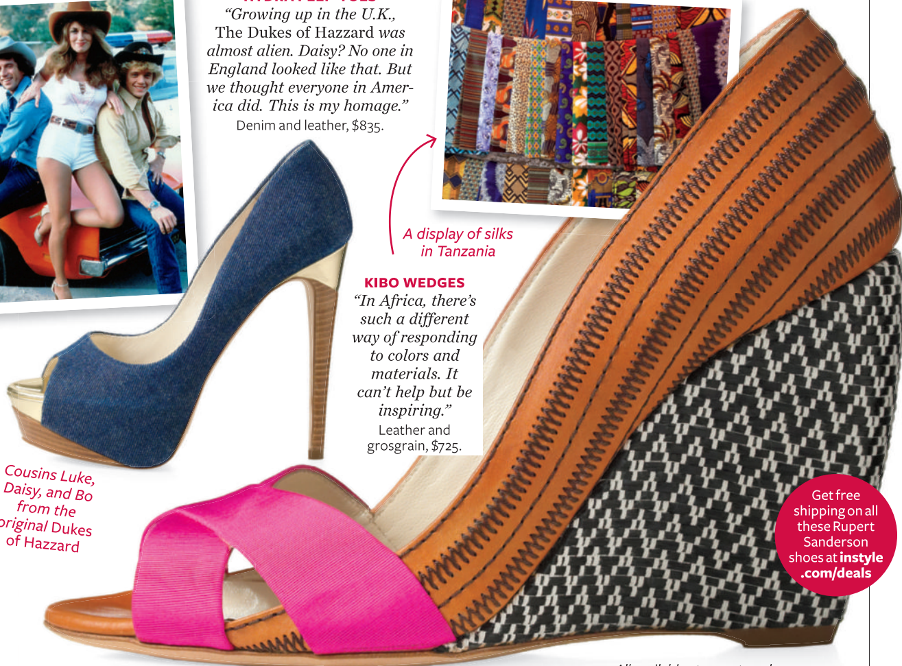
Cousins Luke, Daisy, and Bo from the original Dukes of Hazzard

Get free shipping on all these Rupert Sanderson shoes at instyle.com/deals