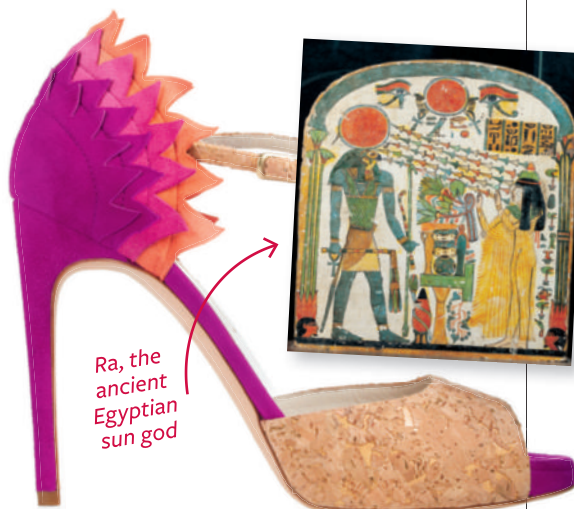
Ra, the ancient Egyptian sun god

Known for A less-is-more philosophy that results in sleek, not overly embellished, footwear His new collection “A huge influence is the wonderful concoction of strong, vivid shades and textures, weaves, and topstitching you sometimes see African women wear.”